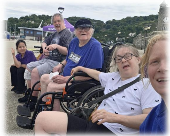
And The Curve at Dover seafront