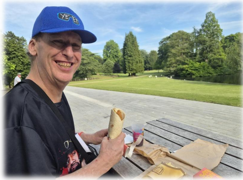
Enjoyed alfresco lunches