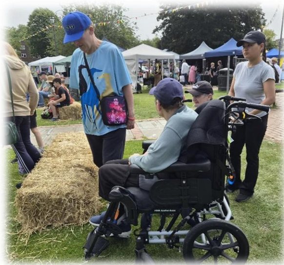
A multicultural festival