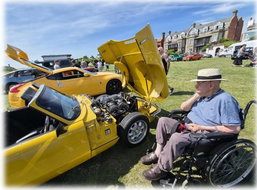
Admired shiny engines at a classic car show