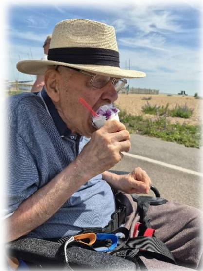
Had the biggest ice-cream competition!