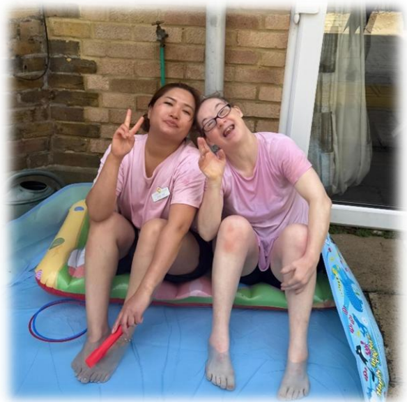
Had lots of fun in the garden