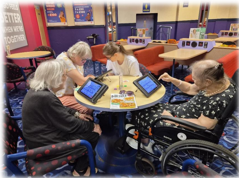
And took full advantage of the air conditioning at the local bingo hall