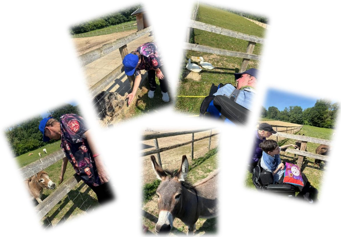
Headed to the local garden centre to see the animals, especially the resident donkeys!