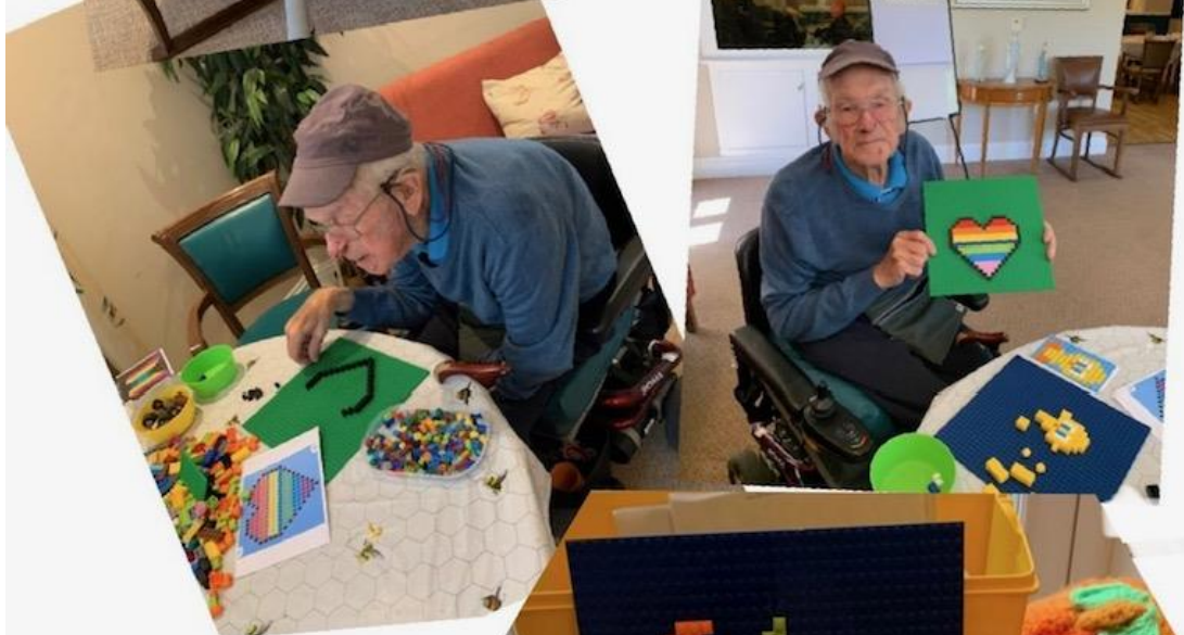
Doing Lego pictures