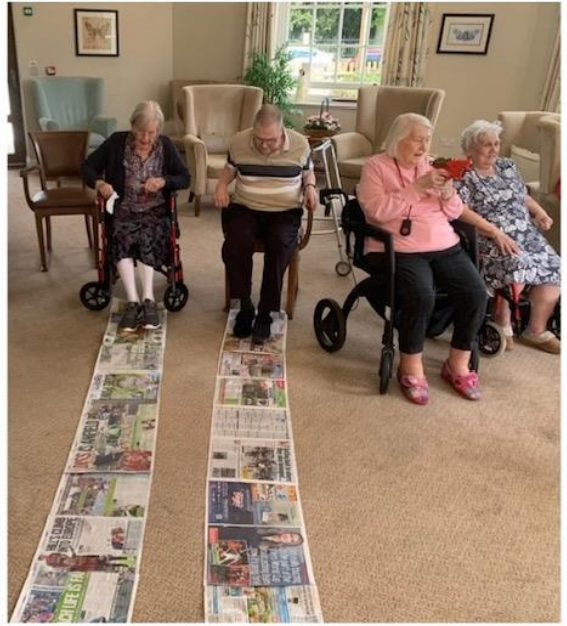
More fun games