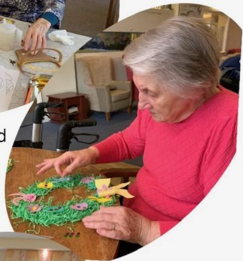
Easter arts and crafts