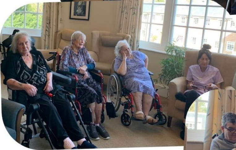
All our yesterdays