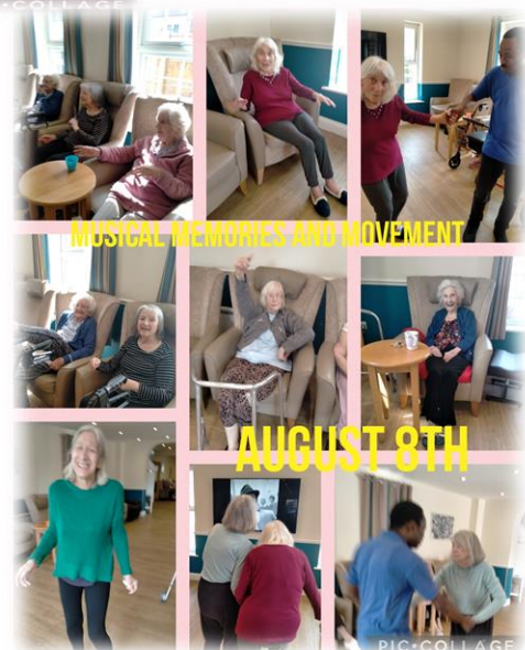
MUSICAL MEMORIES AND MOVEMENT