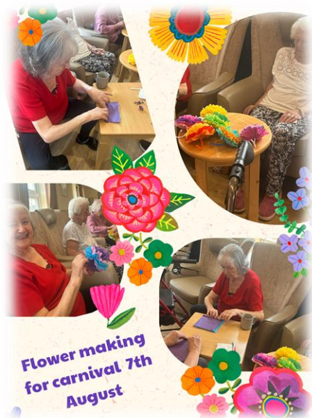
Flower making for carnival 7th August