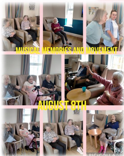
MUSICAL MEMORIES AND MOVEMENT