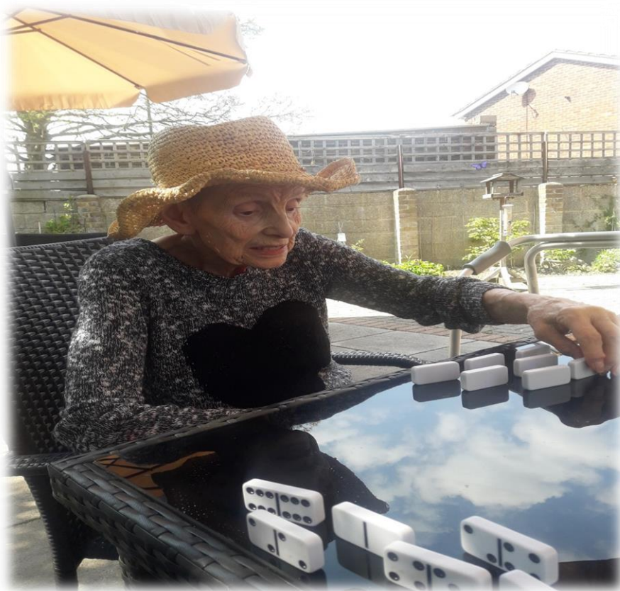
Many sunny days , including Al Fresco lunch ....