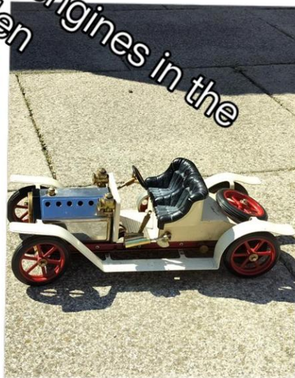
Watching steam engines in the garden