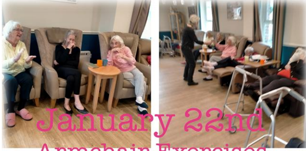
January 22nd Armchair Exercises