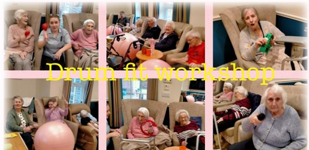
Drum fit workshop