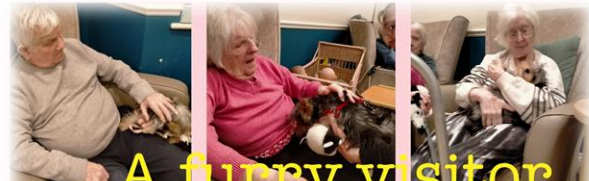
A furry visitor