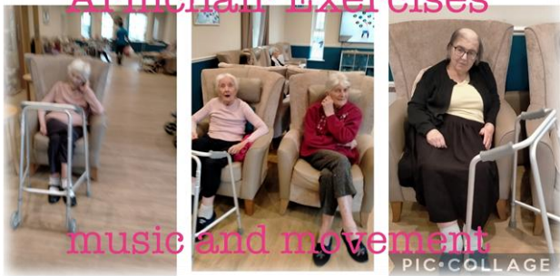
music and movement PIC•COLLAGE