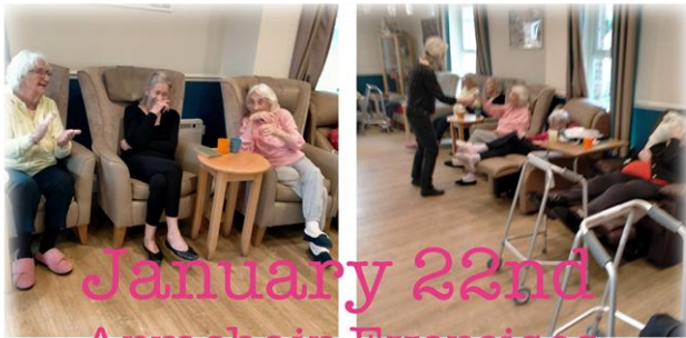
January 22nd Armchair Exercises