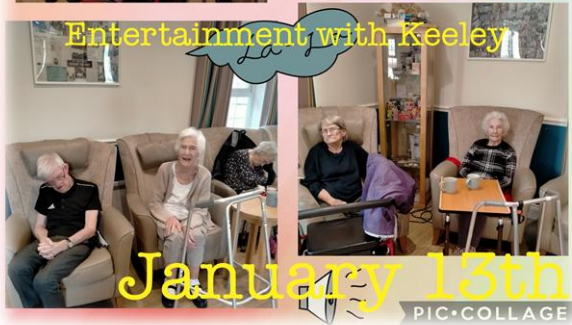
January 13th PIC•COLLAGE