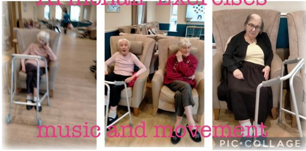
music and movement PIC•COLLAGE