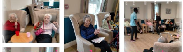
music and movement