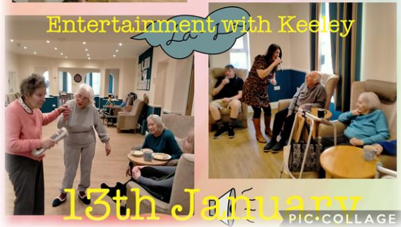
13th January PIC•COLLAGE