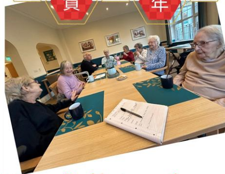
Residents meeting 14th January