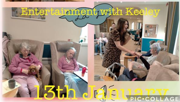
13th January PIC•COLLAGE