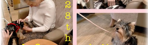
A furry visitor