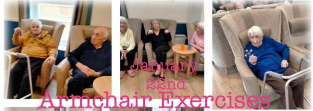
January 22nd Armchair Exercises