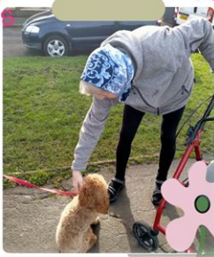
And a walk in the park