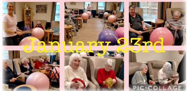
January 23rd PIC•COLLAGE