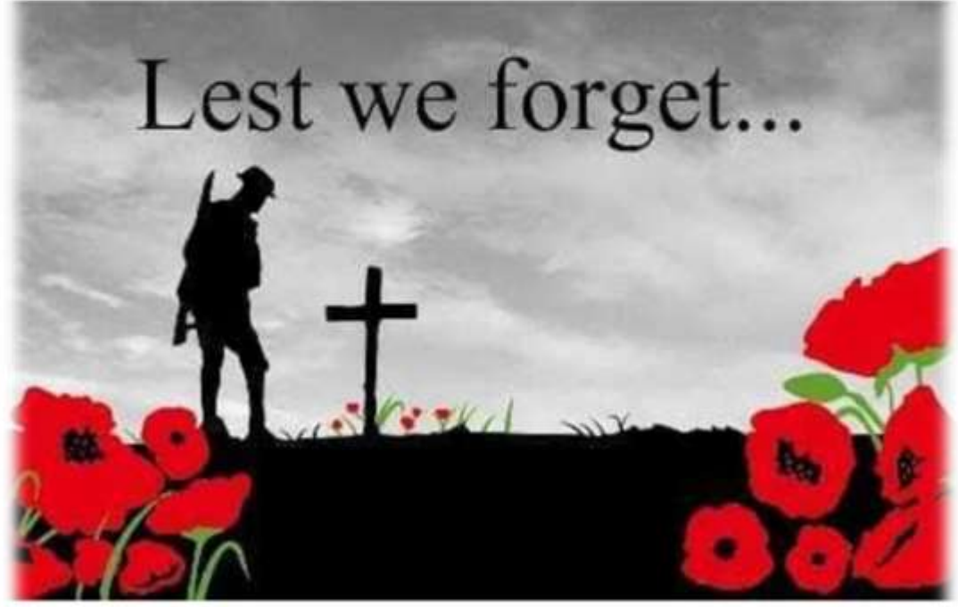
Blair park remembrance display of poppies