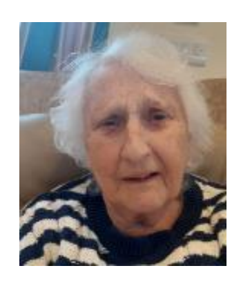
Dot - 6th May