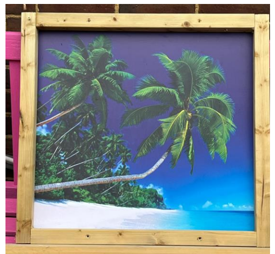
Windows to the beach