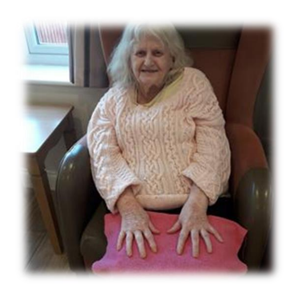
Hand Pampering and nails painted.