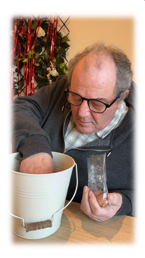
Bulb planting for spring