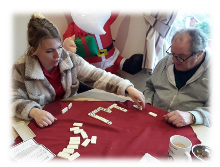
Game of Dominos